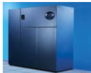
Liebert DS Precision Cooling System

Liebert delivers unparalleled protection of critical systems through a platform comprising power, cooling