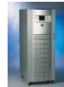
Liebert NX UPS

Along with the partnerships it forms with its customers around the world, Liebert maintains strategic working relationships